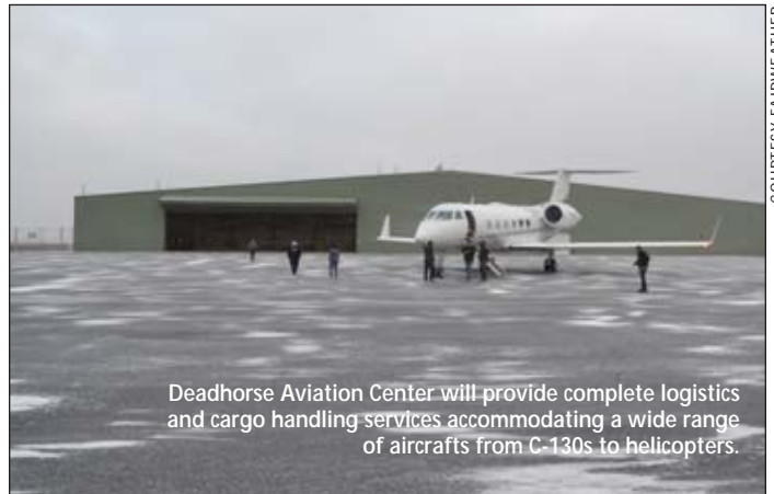
Deadhorse Aviation Center will provide complete logistics and cargo handling services accommodating a wide range of aircrafts from C-130s to helicopters.